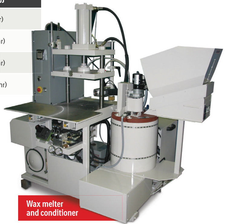
Wax melter and conditioner